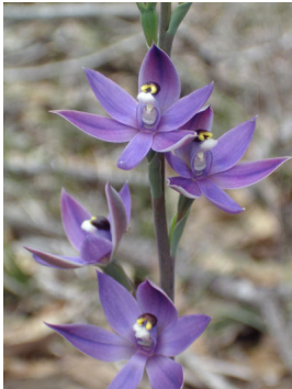
Scented Sun Orchid Thelymitra macrophylla Flowering: November

Over 30 species of orchid have been identified in Manea Park, Bunbury. Orchids belong to a huge family, Orchidaceae , with over 25, 000 species identified world wide. Most of these are epiphytes, plants that grow in trees and occur in tropical and subtropical regions. The 400 or so species of orchid that occur in the SW of Western Australia are terrestrial geophytes - perennial plants which after flowering reduce to an underground storage organ such as a bulb, corm or tuber. This fact sheet illustrates nine common orchids that can be seen in Manea Park.