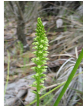
Common Mignonette Orchid Microtis media Flowering: October