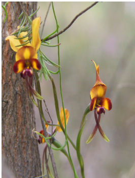
Donkey Orchid Diuris corymbosa Flowering: September