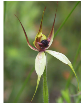
Leaping Spider Orchid Caladenia macrostylis Flowering: Late September