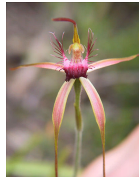
Tuart Spider Orchid Caladenia georgei Flowering: Late September