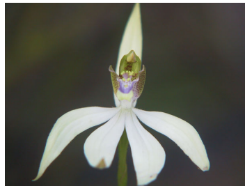
Leafless Orchid Praecoxanthus aphyllus Flowering: Early May