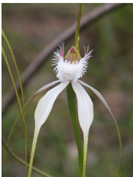
White Spider Orchid Caladenia longicauda Flowering: September